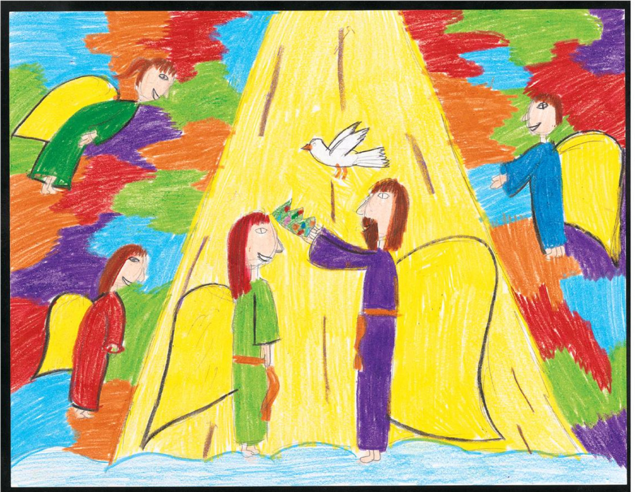
Lauren Yokell, age 10