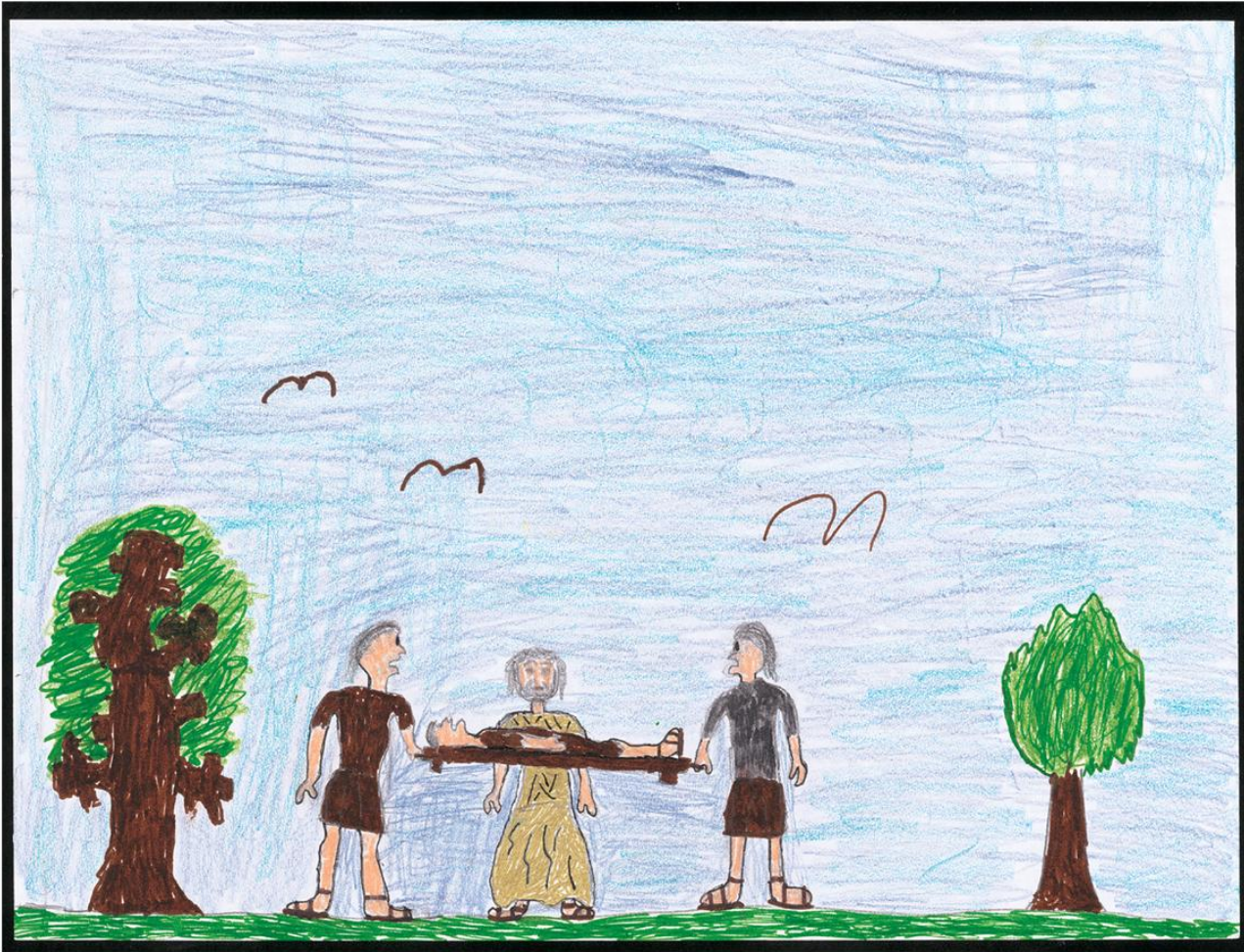
Derrick Hubbard, age 10