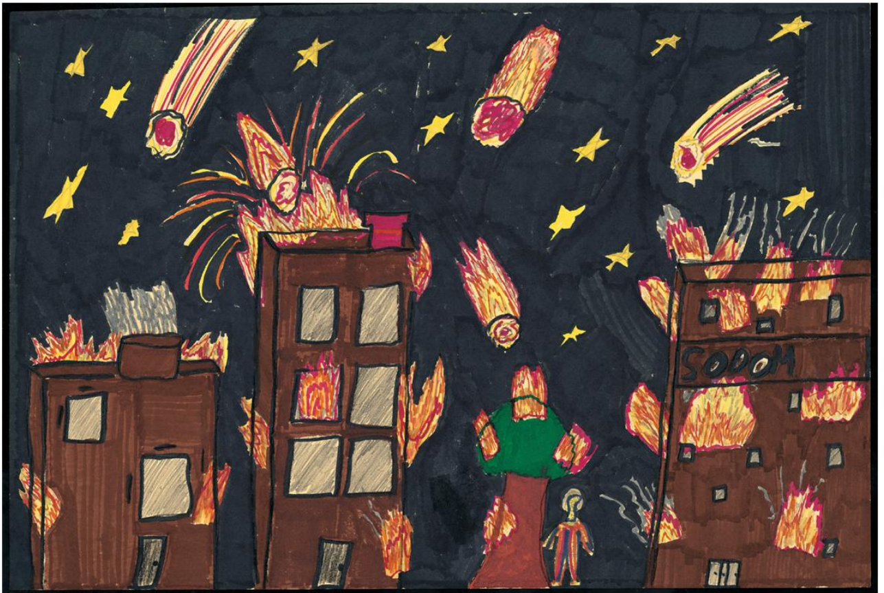
Woody Sorenson, age 9