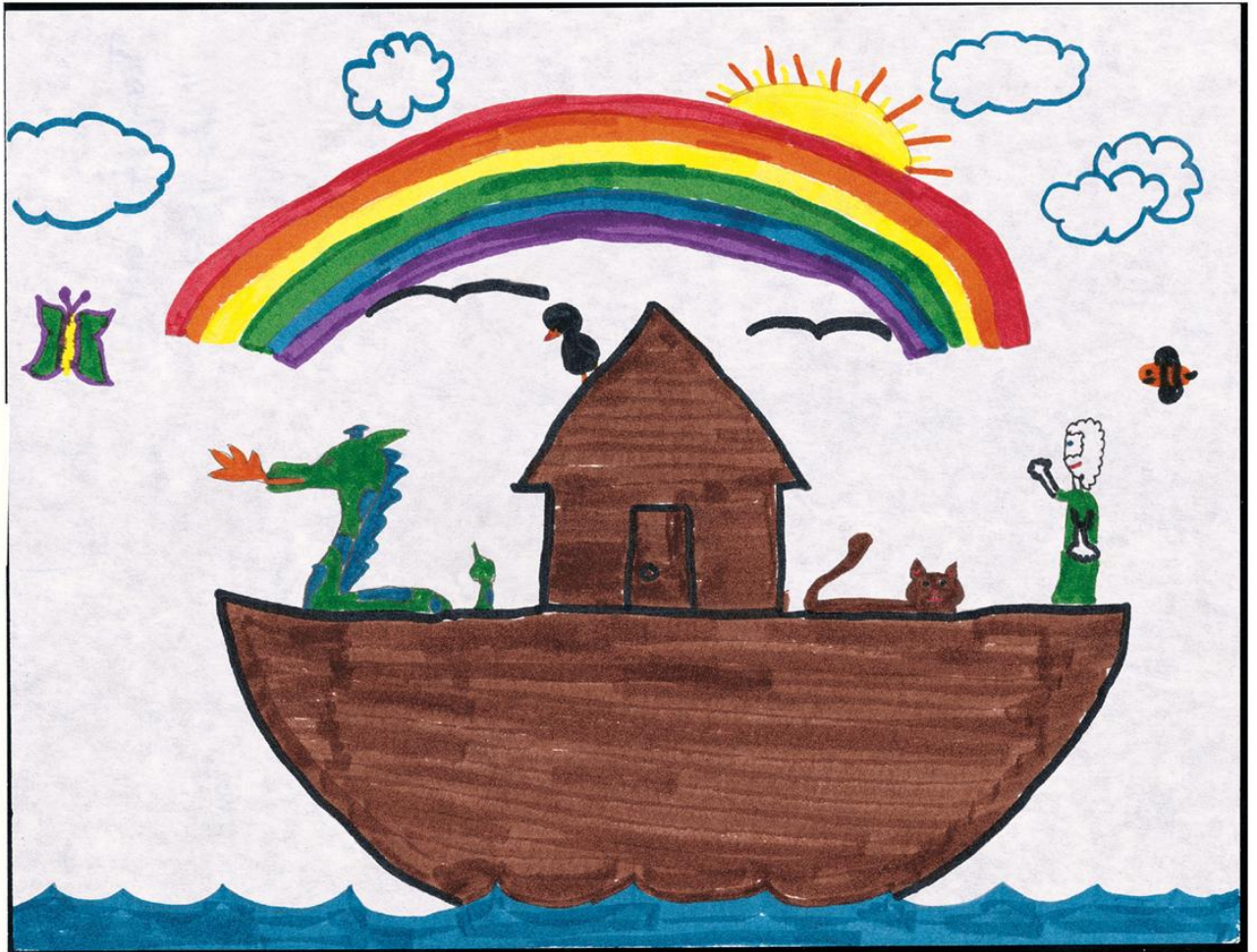
Taryn Flaherty, age 10